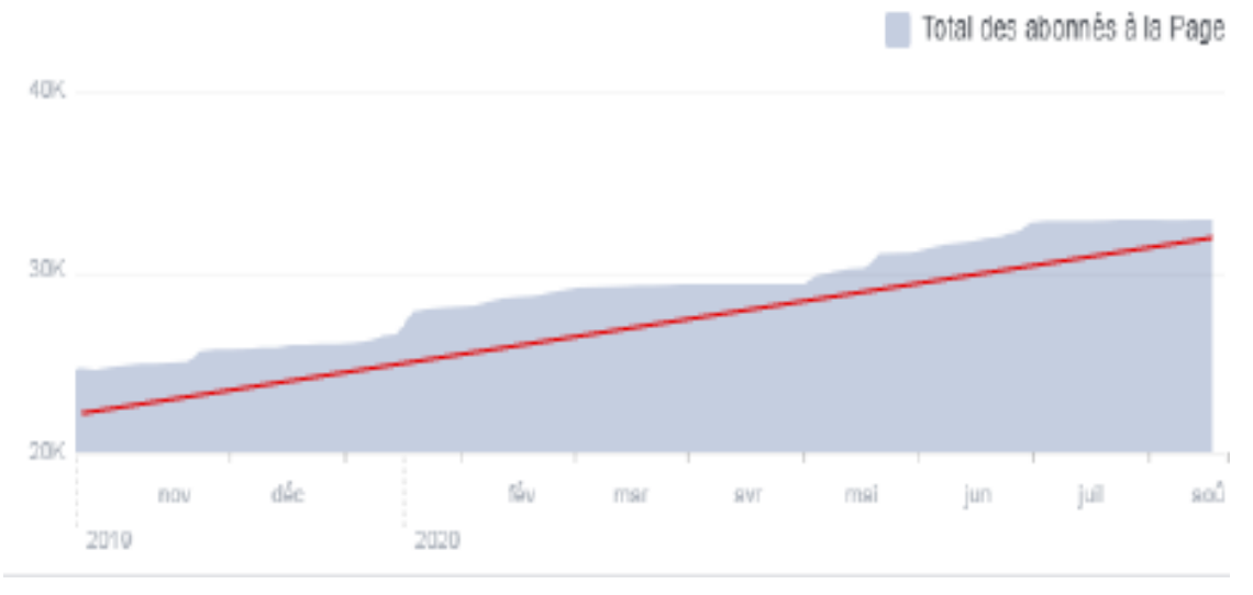
FIGURE 4. EVOLUTION OF THE NUMBER OF SUBSCRIBERS OF THE FACEBOOK PAGE

The number of subscribers corresponds to the number of people who expressed an interest in the company and wished to follow its news. The figure given below clearly shows that the number of fans has continuously increased throughout the period from 2019 to 2020, which suggests that the content offered by Benson Shoes was successful in generating enough interest and satisfaction to attract new customers.