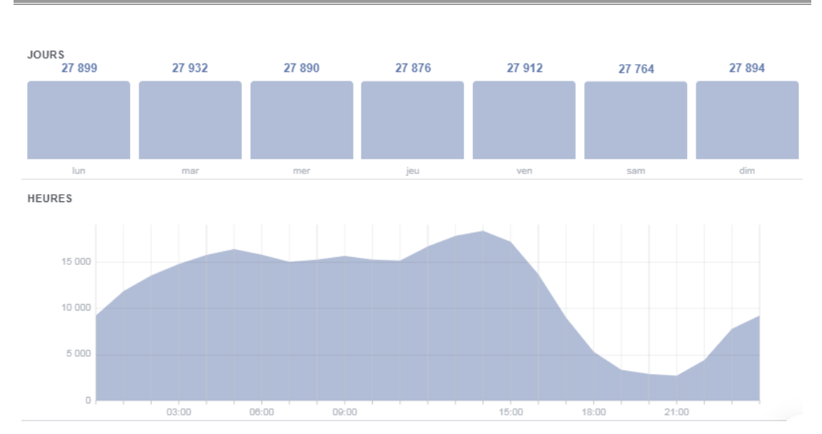
FIGURE 3. DAYS AND TIMES OF VISIT OF THE FOLLOWERS OF THE FACEBOOK PAGE OF BENSON SHOES ALGERIA

The number of subscribers corresponds to the number of people who expressed an interest in the company and wished to follow its news. The figure given below clearly shows that the number of fans has continuously increased throughout the period from 2019 to 2020, which suggests that the content offered by Benson Shoes was successful in generating enough interest and satisfaction to attract new customers.